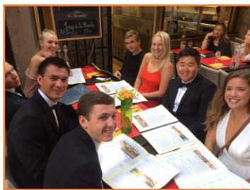
Dinner with co-workers before the red carpet screening.