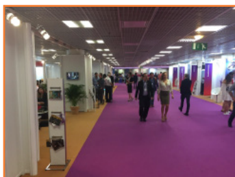
Le Marché Du Film - the international marketplace where films are negotiated and sold.