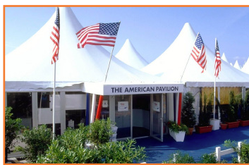
American Pavilion tent.

One of my goals of attending the Cannes Film Festival was to meet people who could give me opportunities that otherwise would have been impossible for me. I had to go out of my comfort zone to speak and network with established men and women in the film industry. By the end of the festival, I was offered an internship position at Series-Fest - a festival in Denver where television pilots are screened and acquired by television companies. I was also given the option to work on the set of Bethany